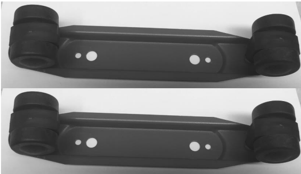
Wheel Plates & Castors x 2