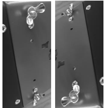
Wing Nuts x 4