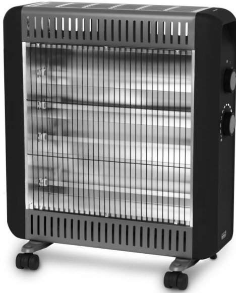
Main Body x 1